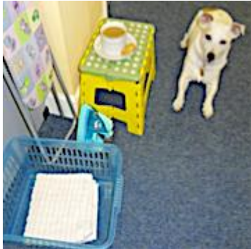
Dotty the author's JRT: All done – time for tea!

Teaching your dog to do some household jobs will positively affect his overall wellbeing. You may see a difference when you go for your walk as better connection builds between you. You may find that your dog is calmer, possibly less reactive, perhaps less determined to pull down the road or to jump up at the lady in the park who always gives free chicken. These changes happen because you have become more interesting and attentive to your dog's needs, and he is becoming more focussed on you rather than somebody or something else. A calmer dog means a more relaxed owner, and this in turn goes 'down the lead' and helps prevent or greatly reduce behaviour issues.