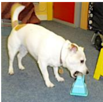
Dotty the author's JRT: Now where is the iron?

Some of the things our dogs do that we find irritating, is perfectly normal canine behaviour. Because we lead such busy lives, we sometimes find it hard to spend quality time with our dogs. While our dogs certainly enjoy their walk in the park twice a day and a good long run on a Sunday, why do they still pester us while we are checking our emails, glancing at Facebook or when we are busy? The answer is simple: they are often bored. But it is so easy to teach your dog to help you with a few tasks around the house, leaving you to enjoy a glass of wine with your feet up at the end of the day without your dog pestering you. The extra tasks you give him will leave him happily tired, satisfied and contentedly resting.