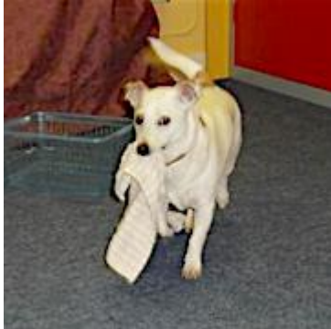
Dotty the author's JRT: Time for some work

We have all looked on in awe and admiration at assistance dogs who happily help their owners in day-to-day life. But have you ever thought about how your dog could help you? Teaching your dog a few jobs around the house is not as difficult as you may think – and is hugely beneficial to both you and your dog. While you might not need a fully trained assistance dog, you might struggle bending down to pick up something dropped on the floor or need a helping hand emptying the washing machine, or you might just be a busy mum with piles of laundry and need a help stacking the washing machine to save time!